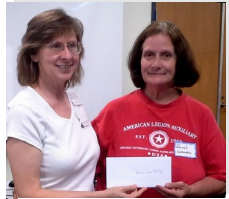
American Legion Auxiliary

Portion of the proceeds from the Spring Craft Fair & Car ART event benefited these two non-profit organizations