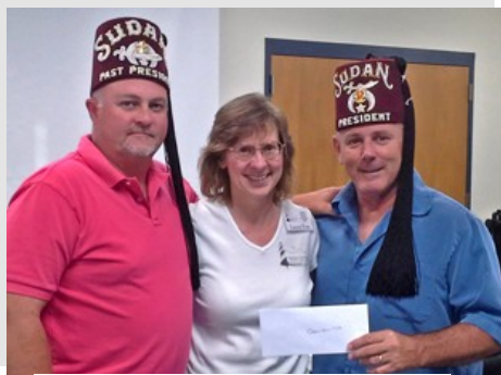
Onslow Shrine Club