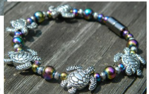
The image below is Acid wash magnetic hematite with pewter sea turtles

These stunning pieces have a rainbow effect to the magnetic hematite stones that makes them a versatile piece of therapeutic jewelry that can be worn with just about anything. You'll find this stone in several of our most popular pieces.