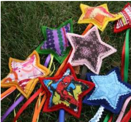
Rice bags Shooting Stars !! Great idea for Art: Left and found

Tips: Label your art with a note or a tag stating that it is Left and Found Art include your contact email or artleftandfound@yahoo.com